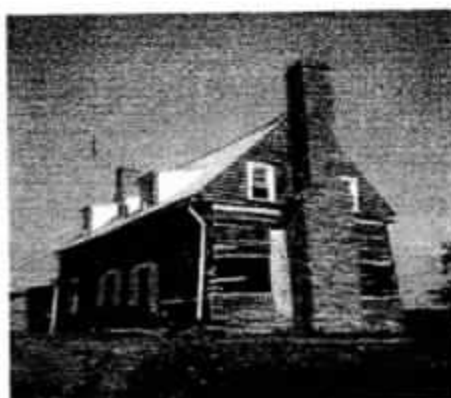
THOMAS PRICE HOUSE